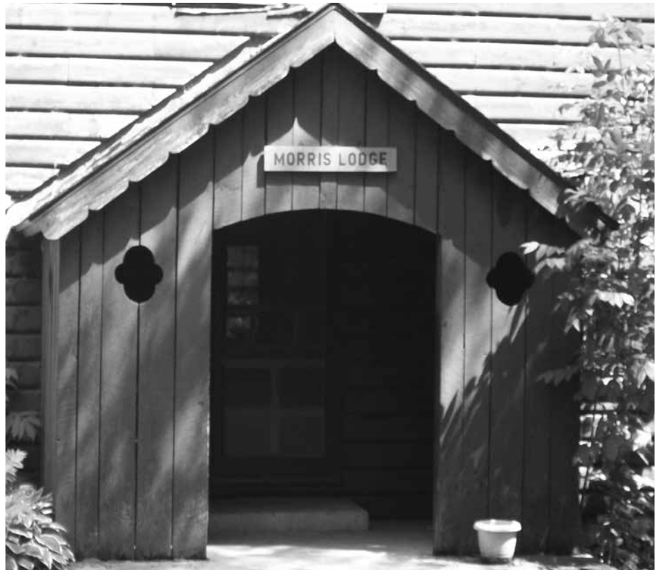
The entrance to Morris Lodge at Camp Tannadoonah.

Ava lives in Exchangettes, which is a cabin located by the store and next to