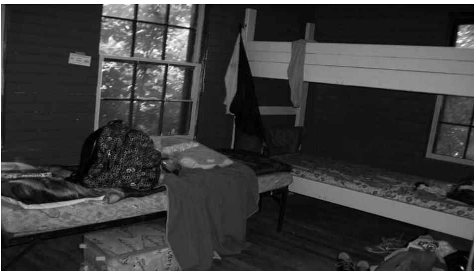
A typical "bunk" inside Morris.

Although not all of the cabins are mentioned, it will just make it a surprise for anyone who gets into one of those cabins a different week. No matter what cabin you are put in, it's going to be a great week!